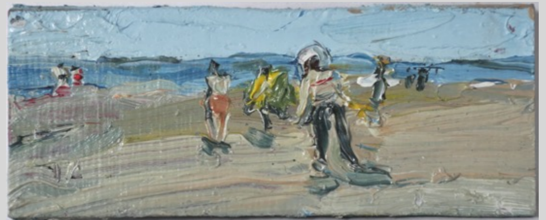
II Oil on board, 4cm x 10cm.