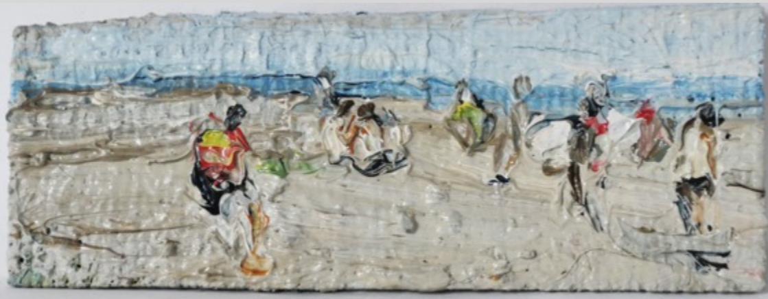
I Oil on hessian, 4cm x 10cm.