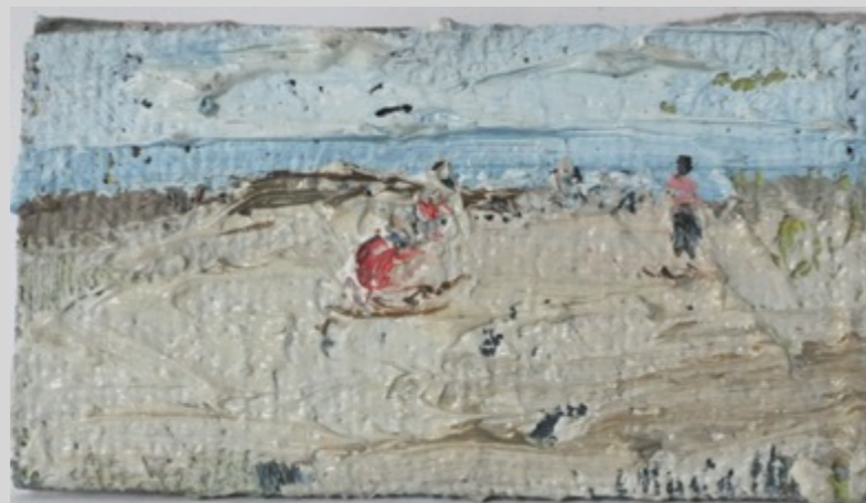
III Oil on hessian, 5.5cm x 10.5cm