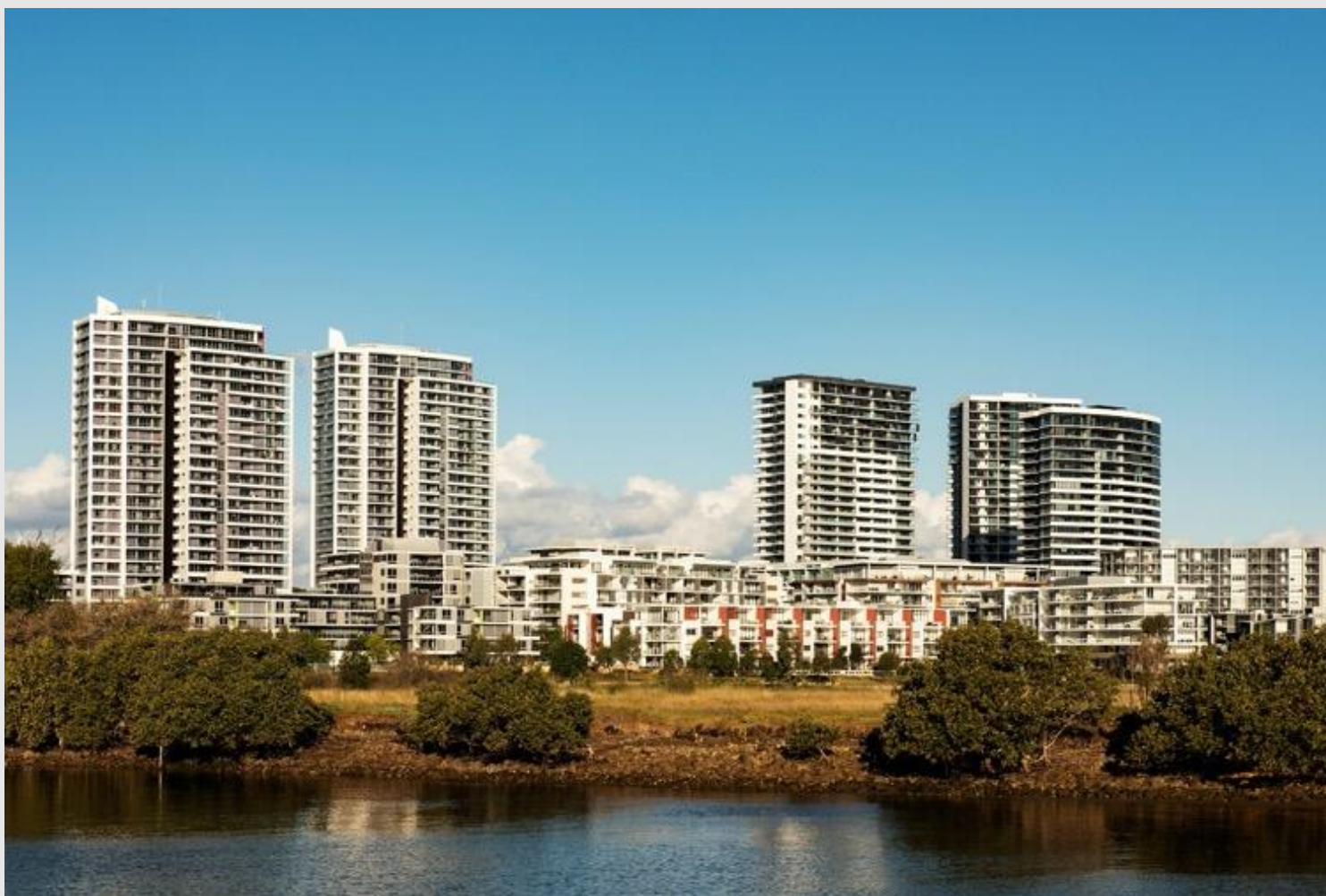
'Olympic Park, Sydney' Pigment print, 1/3 1100 x 735 mm 2019/2021