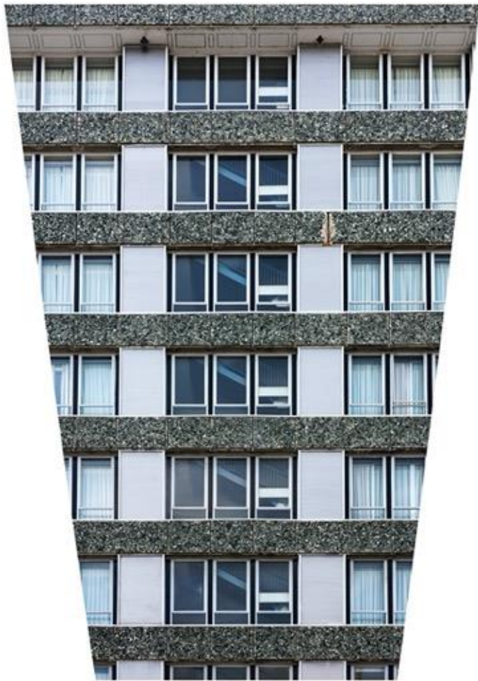
'Scenic Hotel' Pigment print, 1/3 915 x 1220 mm 2021/2021