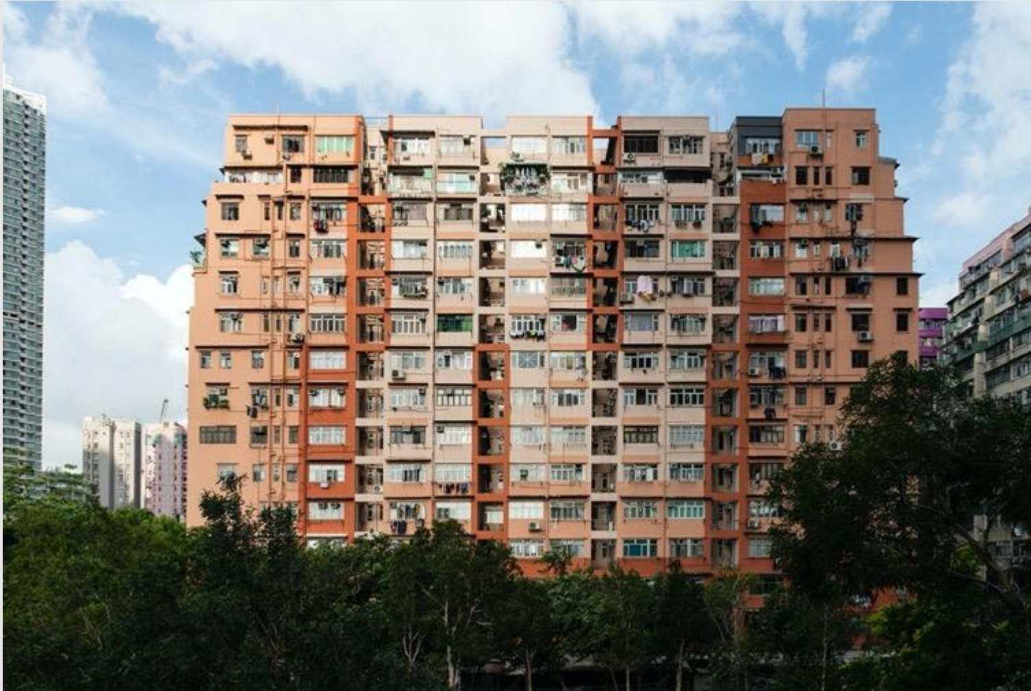
'Flats, HK' Pigment print, 1/3 1100 x 735 mm 2017/2021 # 3