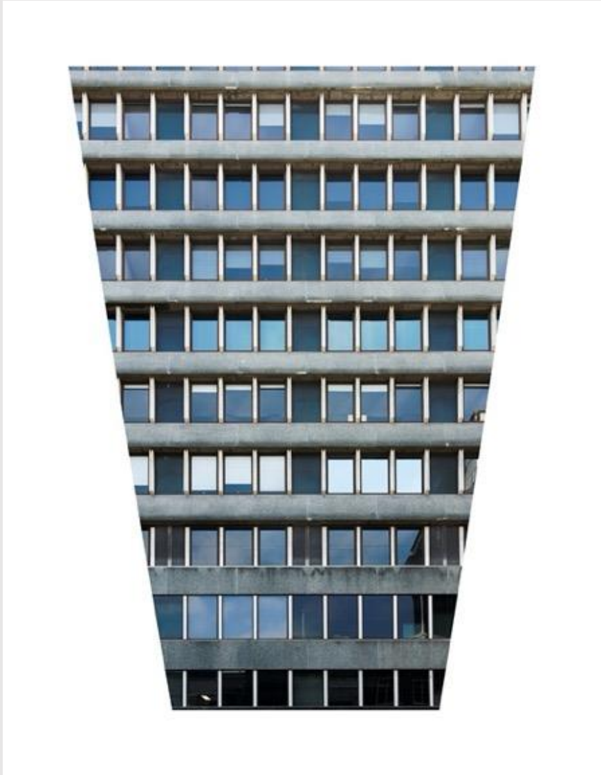
'John Wickliffe' Pigment print, 1/3 915 x 1180 mm 2017/2021