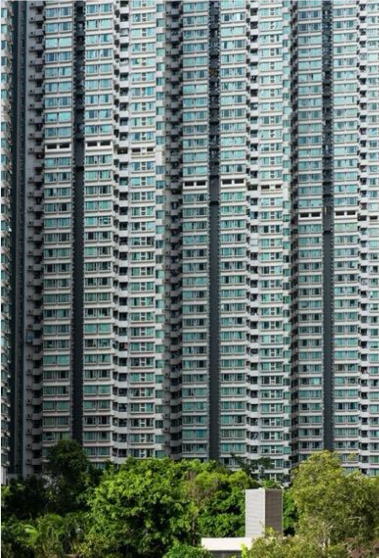
'Apartments, HK' Pigment print, 1/3 740 x 1095 mm 2017/2021