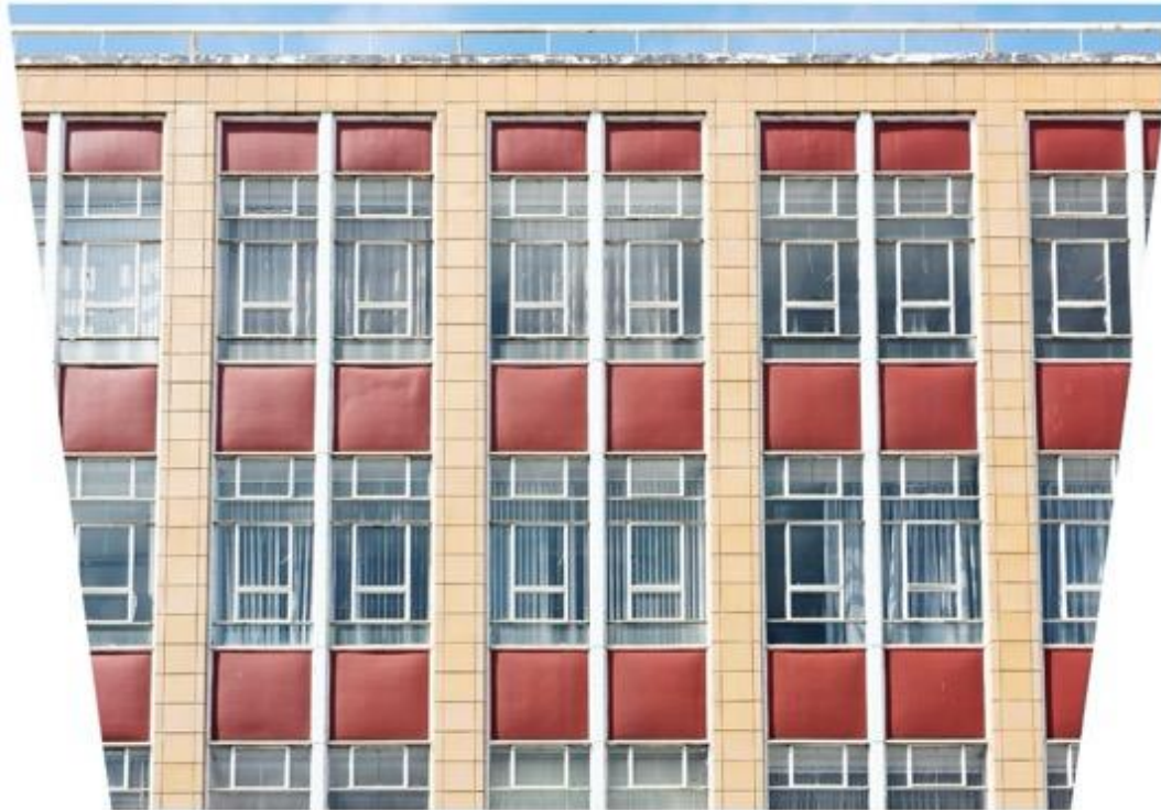
'Manse St' Pigment print 1/3 1220 x 915 mm 2021/2021